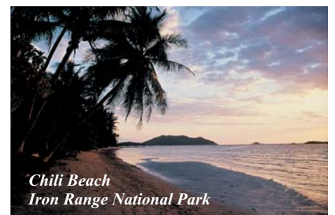
Chili Beach Iron Range National Park