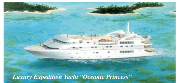
Luxury Expedition Yacht "Oceanic Princess"

Another exciting development is the brand new Luxury Expedition Yacht "Oceanic Princess" which comes into service later this year. This is a real bonus for intended travellers to the Cape, now being able to combine a luxury Great Barrier Reef cruise with a first class safari. The new "Seafarer" combines the "Discoverer" camping safari with a southbound cruise while the "Mariner" cruises north and follows the "Explorer" camping safari south to Cairns.