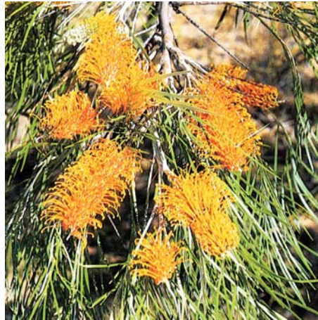
Golden Grevillea ( grevillea pteridifolia )

Among its genera are Telopea , one of its species being the famous Waratah ( T. speciosissima ), floral emblem of New South Wales, while other genera such as Grevillea , Banksia , Macadamia and Hakea are well known to most Aussies.